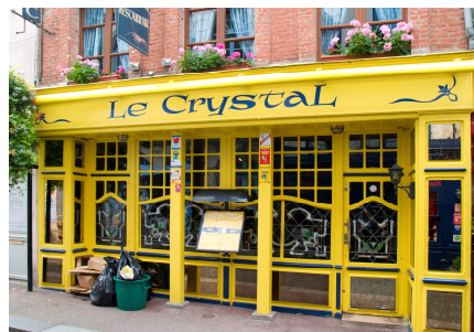
A Bistro in Honfleur, France