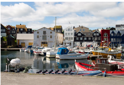
Torshavn, Norway Fishing Harbor

By September, we were suffering from travel deprivation, so we booked a 10-day bus tour through California. The tour went from San Francisco to Los Angeles with many interesting stops, such as Yosemite National Park and the Hearst Castle. Even though we spent many hours riding on the bus, it sure was nice having someone else do the driving.