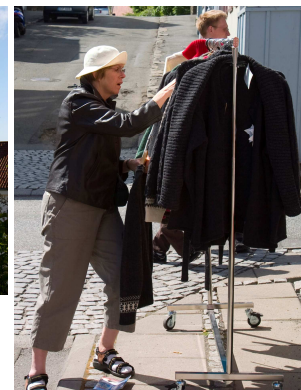
Adele attacks the sale rack