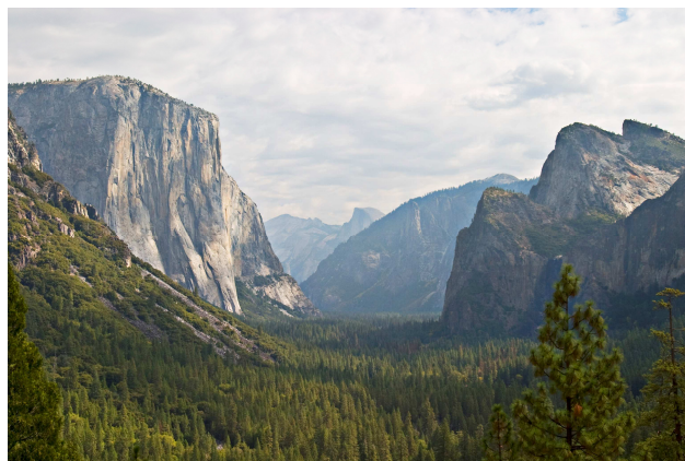
Some valley in California—I forget which one.