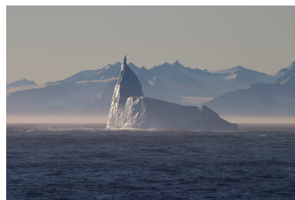
Prince Christian Sound, Greenland