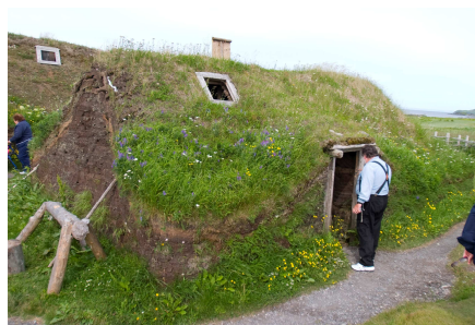
Viking House, L'Anse aux Meadows