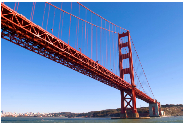
Some bridge in California—I forget which one.