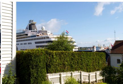
Sometimes our ship dominated the town