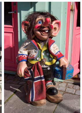
Hello from Stavanger!