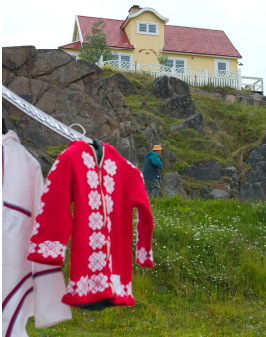
Color in Qaqortoq