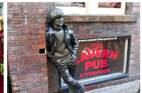
Hanging out in Liverpool